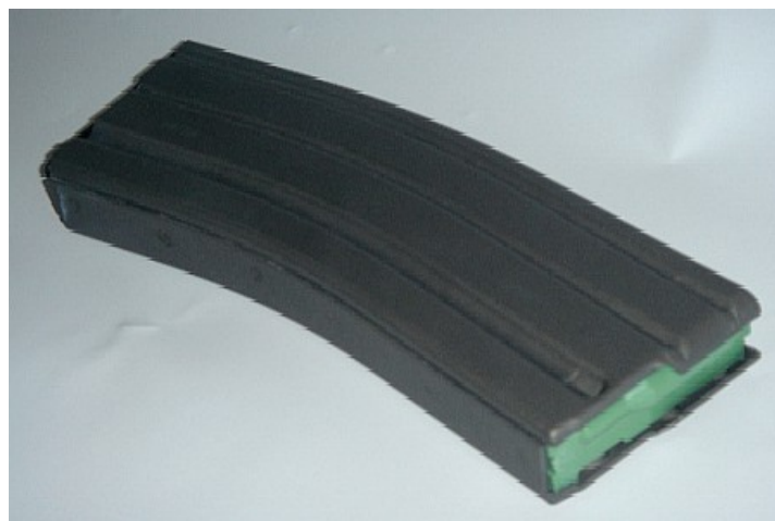
Fig 2.1: USGI M16 30-Round Magazine with 2 nd Generation Green Follower

The M16/M4 weapon system utilizes a detachable box magazine to feed ammunition into to the firing mechanism. The standard USGI magazine holds 30 rounds of 5.56x45mm NATO ammunition and provides the user with a more convenient method for handling, carrying and utilizing those rounds. Without a reliable magazine to feed the ammunition into the weapon, the M16/M4 system ceases to function properly. Operating the M16/M4 while having to diagnose problems and performing corrective action under the stress of combat, dramatically decreases user effectiveness and it will get operators killed. Since both the individual magazine components and how they work together affect reliability, each basic part that constitutes a complete magazine assembly will be introduced and its purpose discussed.