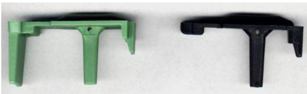
Fig 3.1: USGI M16 30-Round Magazine Followers (2 nd Generation Green and 1 st Generation Black) from AR15.com

The original Vietnam-era M16 magazine was straight, with a 20-round capacity and utilized a relatively flat, metallic follower. One problem encountered during this time was the tendency for soldiers to attempt to load their magazines beyond the maximum 20-round capacity. While some individual 20-round magazines can be forced to hold more, this sometimes caused the spring to become over-compressed and then subsequently bind. Once a spring became bound to itself, the magazine would lose spring pressure and fail to feed rounds into the weapon. This is one of the largest failures of the original 20-round magazine design. To address this and many other issues, the current USGI 30-round curved magazine was developed.